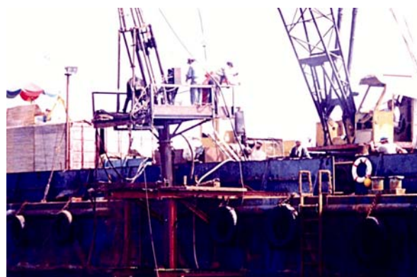
Figure 2: The side drilling platform on the top of the vertical casing pipe.

The drilling machine was installed on a platform on the top of the casing but the power unit was placed on the barge. The power was transferred via the linking cables/hoses to the drilling motor. The drilling personnel worked on the platform, as shown in Figure 2, on the top of the casing. Drilling rods were pushed down through the 12inches casing. A crane was used to help the erection and drilling processes.