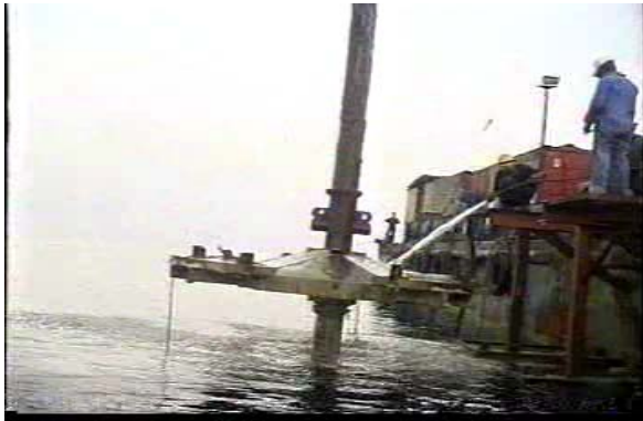
Figure 5: The seabed frame

Shear-Vane and Pocket Penetrometer tests were also done on the samples at site.