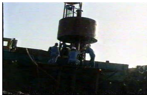
Figure 3: Cylindrical steel tank fixed to the casing pipe to prevent buckling